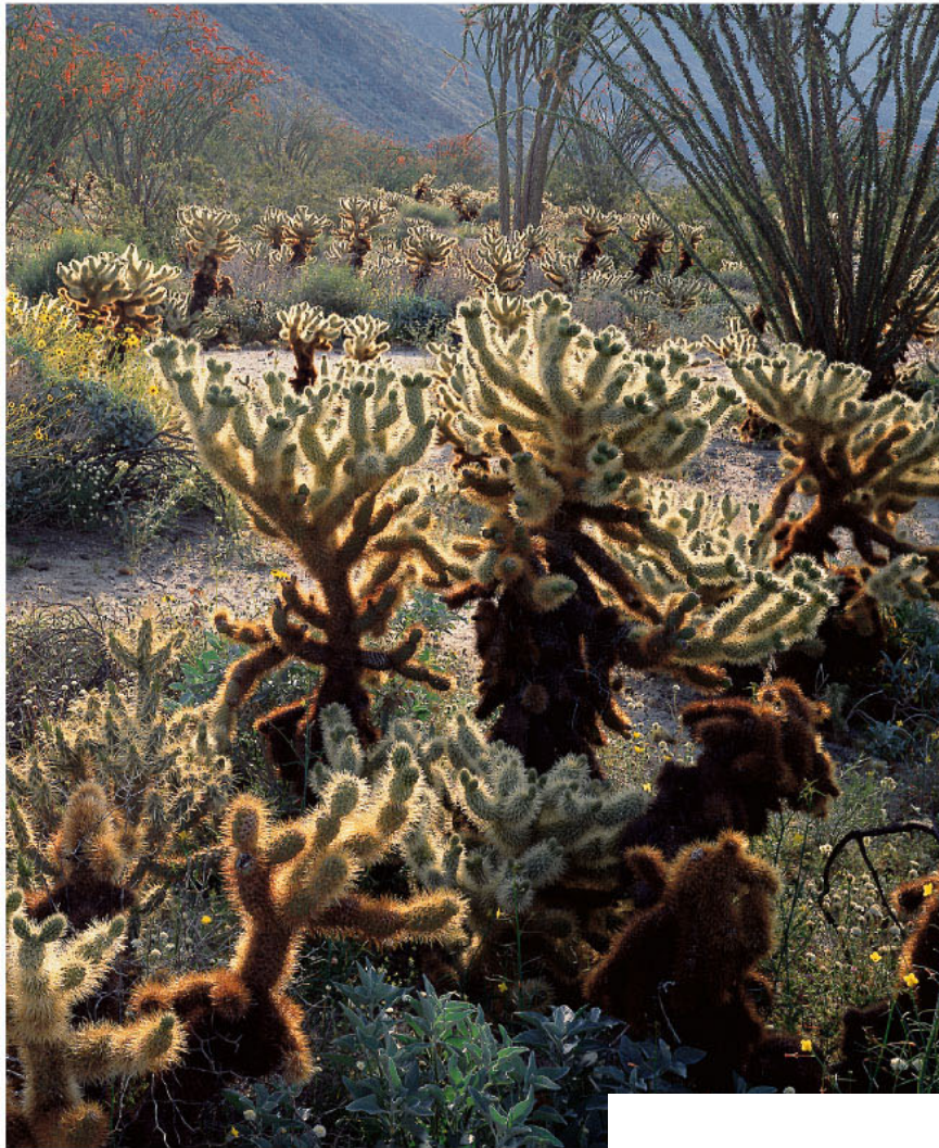
Anza Borrego Desert, Califc