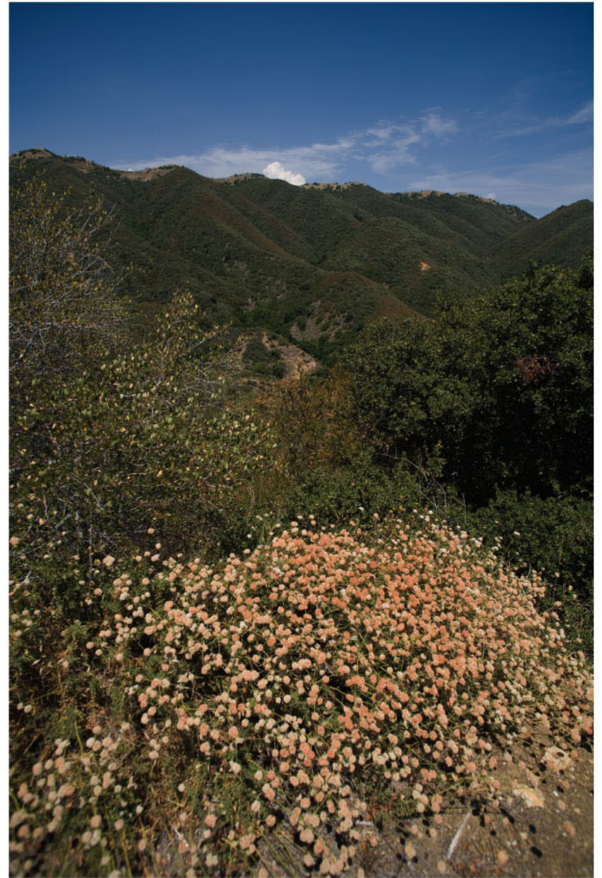
Santa Barbara, California

LIFE: THE SCIENCE OF BIOLOGY, Eighth Edition © 2007 Sinauer Associates, Inc. and W. H. Freeman & Co.